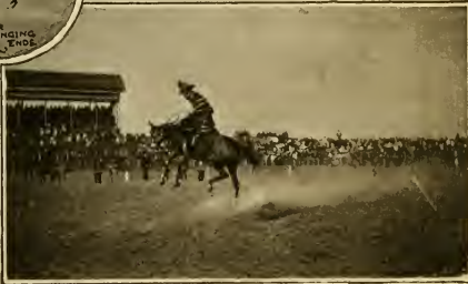
A SHUFFLING PITCHER.